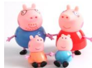
Peppa Pig action figures